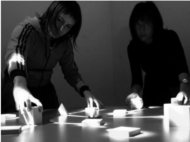
Figure 2. Two performers playing with the reacTable*